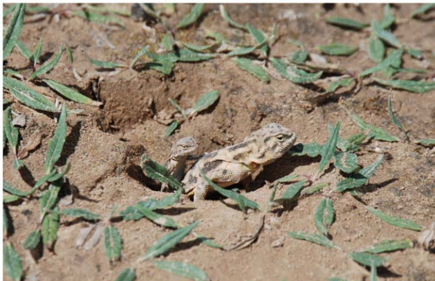
Figure 1. Female Phrynocephalus vlangalii in a burrow with a young juvenile.

We tested for significant differences between males and females in morphological traits that typically correlate with lizard mating